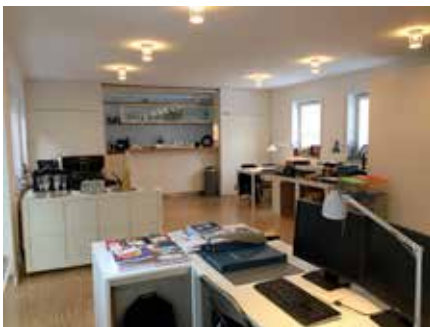
Office and kitchen

And we will also cook together and prepare some of our meals together. There's a kitchen in our office that we can use. Take good recipes with you! Like an advertising slogan in Germany: Most patys end up in the kitchen.