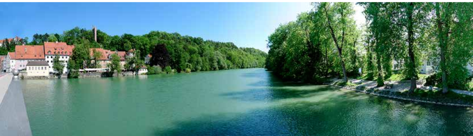
Landsberg am Lech

If possible somebody will pick up at the airport and go with you by train to Landsberg. Anyways, we will send you a detailed description for the travel. Don't worry.