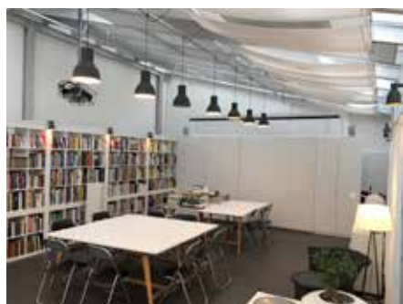
Office and work space

Following World War II it was the location for one of the largest Displaced Person (DP) camps for Jewish refugees and the place of execution for more than 210 war criminals after 1945.